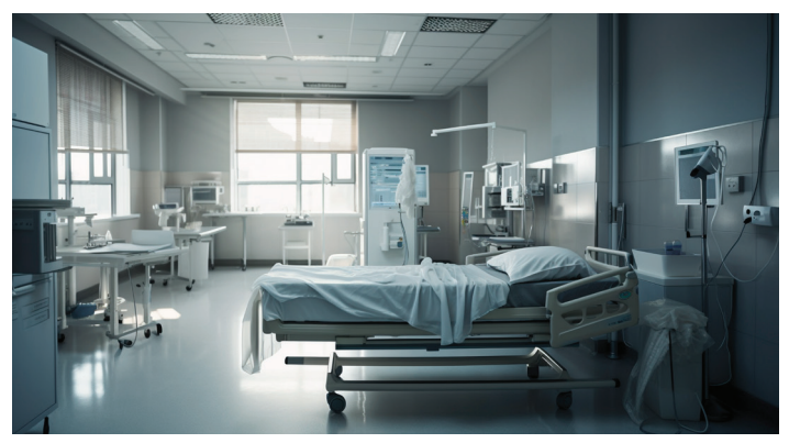
HOSPITALS AND RETIREMENT HOMES