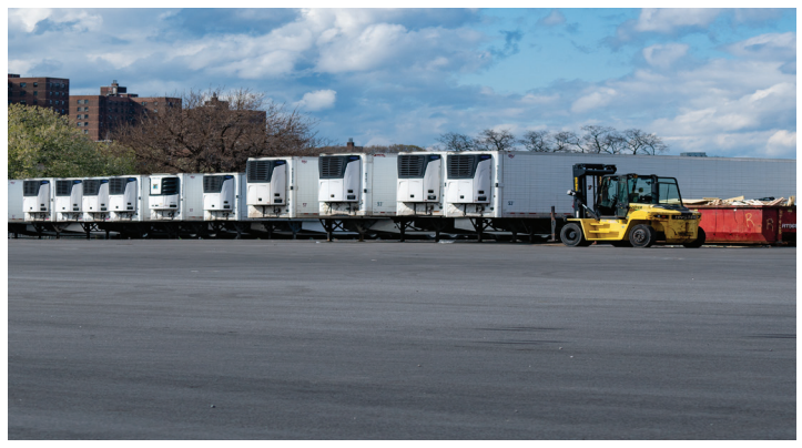
TRANSPORT VEHICLES AND REFRIGERATED VEHICLES