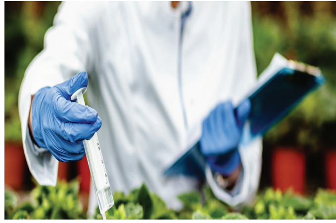
FOOD AND BEVERAGE INDUSTRY