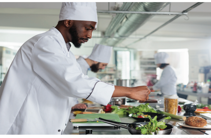
CATERING AND HOSPITALITY